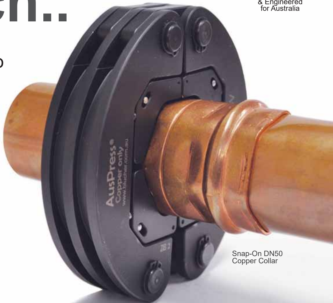
Snap-On DN50 Copper Collar

Engineered to rid the pinch with DN40 and DN50 copper press fittings using concentric press collar technology.